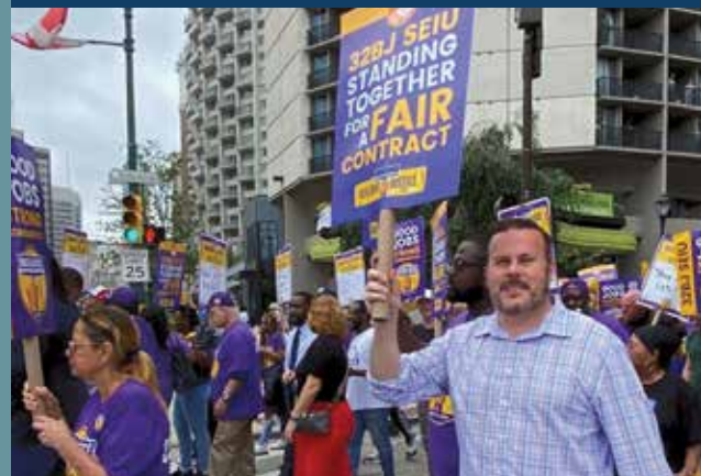
Standing in solidarity with the service workers of SEIU