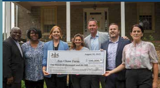
At Fox Chase Farm with my colleagues presenting a $100,000 preservation grant for its historic Manor House.